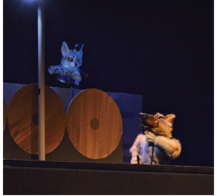
Adventures of an environmentalist student: Savannah exploring the phantastic sea life and shooting at her villainous Professor Bailey to save her sweetheart Makani.